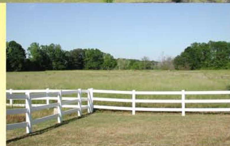
Picture above shows view from Parcel 1 looking toward Parcels 2 & 3. Picture below shows water access.

Call or see web for more details 800-996-2877 www.GTAuctions.com