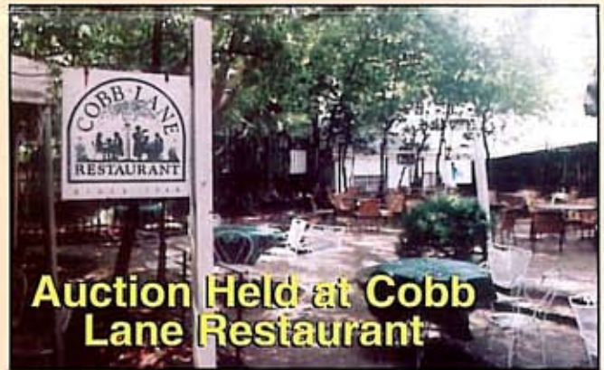
Auction Held at Cobb Lane Restaurant